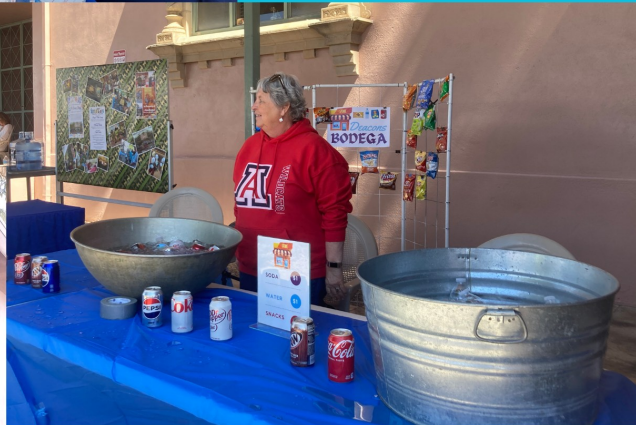
4th Avenue Street Fair