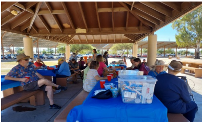
Church Picnic at Reid Park