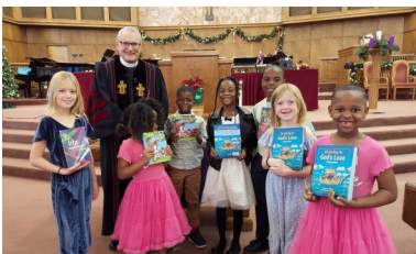
Youth Bible Presentation 11/30