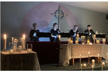
All Saints Candlelight Service