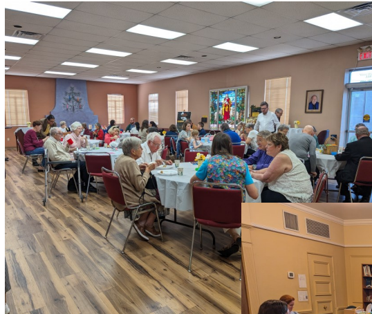
Easter Brunch in Fellowship Hall