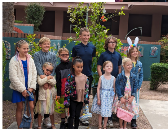
After the Egg Hunt in the Courtyard