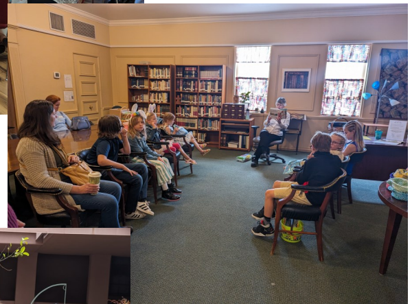
Easter Story in the Library