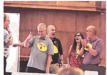
Photos from the YAV Southwest Showdown