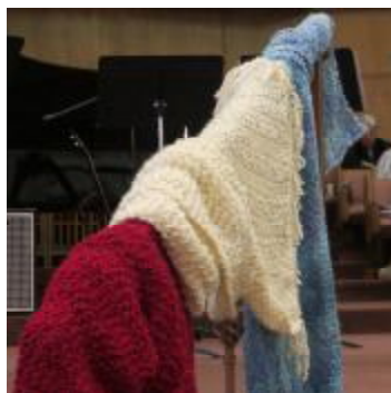
Photos of Prayer Shawl dedications on Sunday, February 7